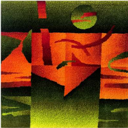
No - 261