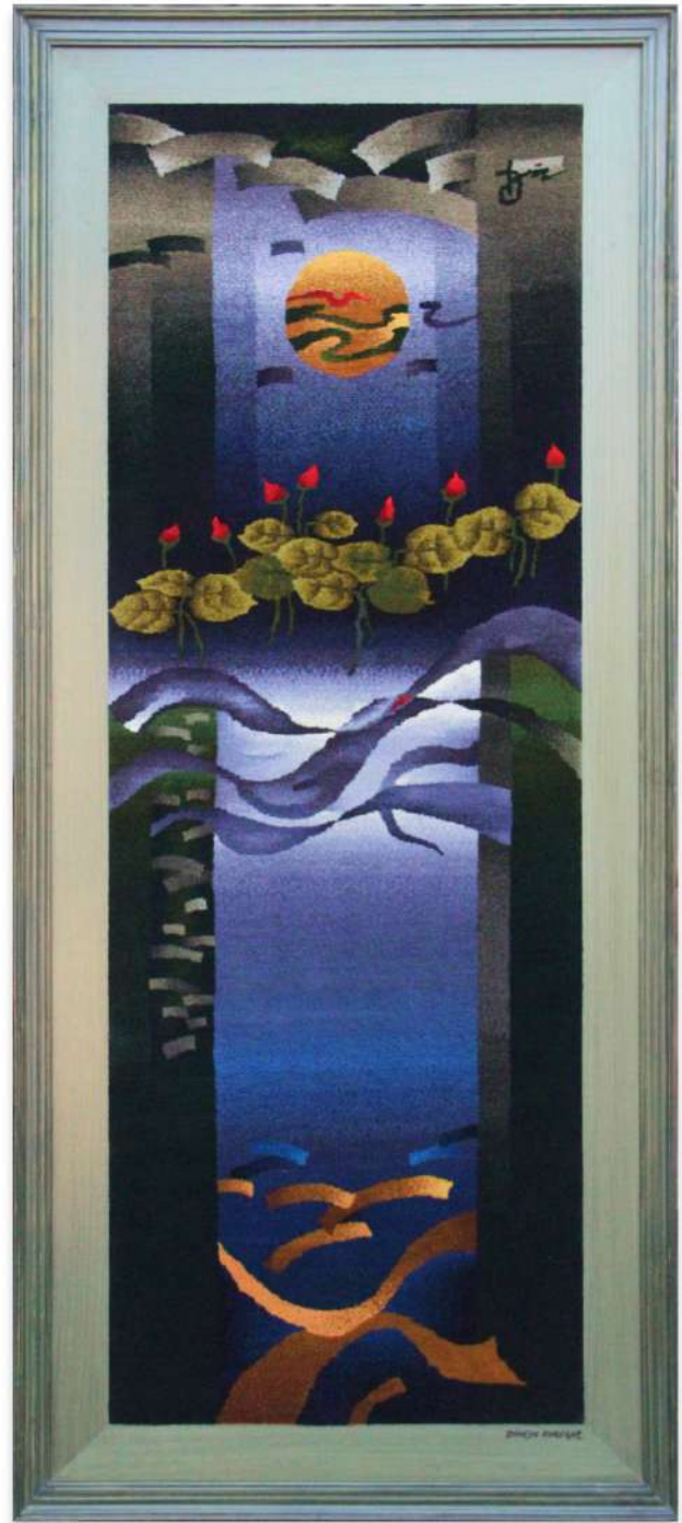
No - 152