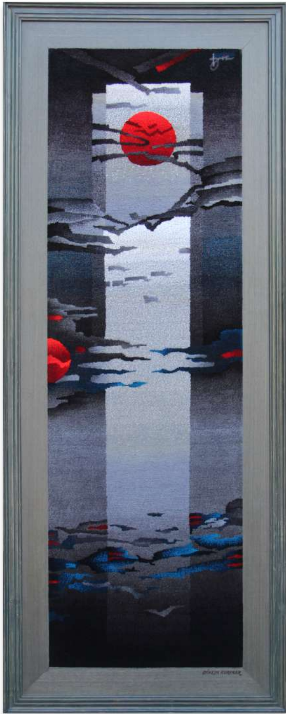
No - 160