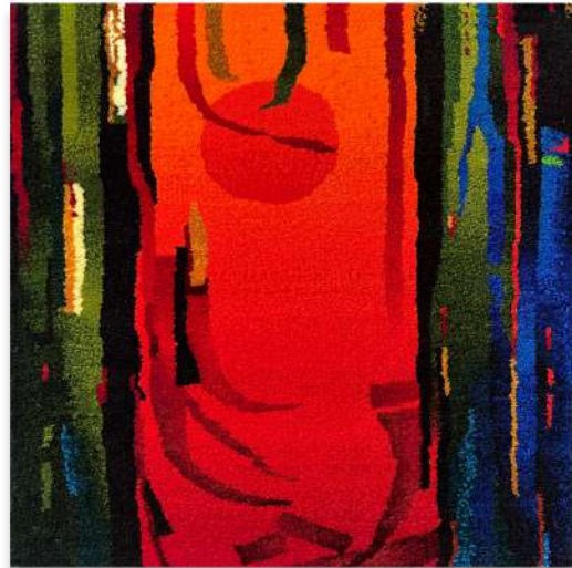
No - 248